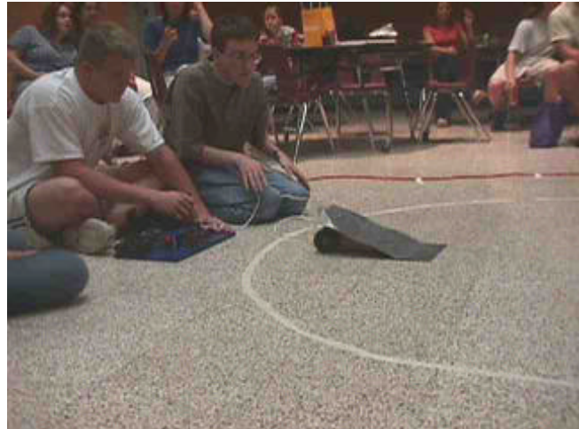
The “Flying Wedge” – HHS 2001 winner

these movements clearly, easily, and consistently, the score will be 50/50. One point extra credit will be awarded for each match the car wins. Moving forward due to a tie does not qualify as a win.